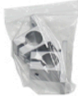
Mounting block accessories