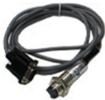
Fiber optic sensor