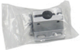
Bracket mounting base