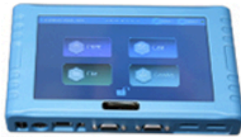
TX-800 TIJ PRIINTER