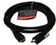
Nozzle link cable