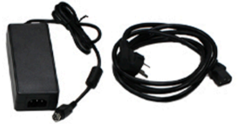
30V 30A Power adapter