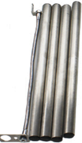
Stainless steel tube