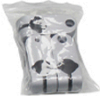
Cross mounting block