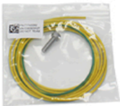
Aluminum alloy print head ground wire connection